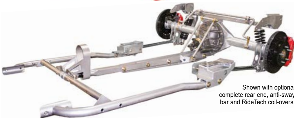
Shown with optional complete rear end, anti-sway bar and RideTech coil-overs.

Painting & powder coating for display only