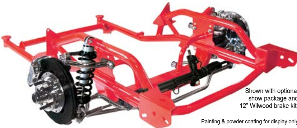
Shown with optional show package and 12" Wilwood brake kit.

Painting & powder coating for display only